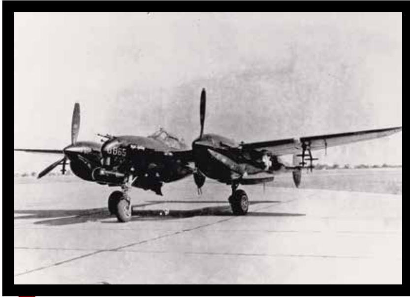
The "night version" of the P-38 Lightning carried both a pilot and radio operator. Some sergeant pilots using the P-38 on Guadalcanal had the skills to reassemble P-38s that had been shipped to the Pacific Theater in crates.

15,000-pound burlap-wrapped pallets of ammunition out of the B-17 bomb bay doors. The officers and enlisted men aboard these planes showed great skill, versatility and composure in successfully learning how to orchestrate these bomb bay supply drops. The 13th Air Park Squadron (later