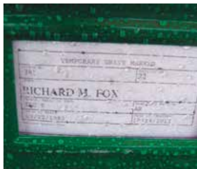
In recent years, Missing in America Project interment services have taken place across the country in locations like Austin, Texas, (top left); Quantico, Va., (top right and bottom right); and Medical Lake, Wash., (bottom left).