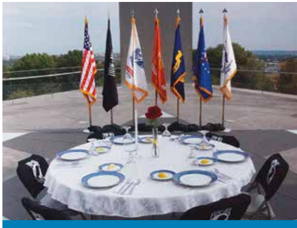
A POW/MIA Table is displayed at the Air Force Memorial for the 2014 POW/MIA Commemoration. This year's ceremony at the Memorial will be Sept. 18 at 1 pm.

At press time, VA was reportedly finalizing a rule that would expand eligibility to these individuals. Assuming the Office of Management and Budget approves the change, it would mark the first time that VA established a special category of Agent Orange exposure for military personnel who did not serve in country (aka, “boots on the ground” and “brown water navy”).