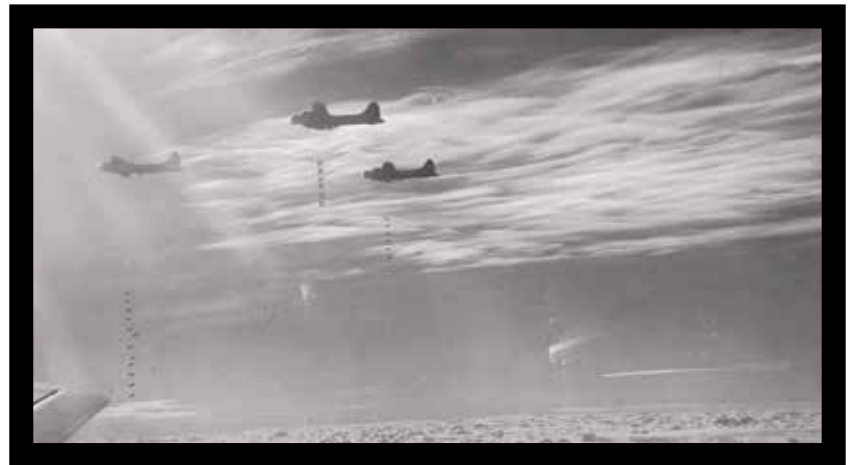
B-17s drop bombs through the clouds on Axis targets in 1944. Above Guadalcanal, the Flying Fortresses were used not only for reconnaissance missions but also for bomb bay supply drops to the troops down on the island.

One particular sergeant pilot had a memorable moment when he was preparing to evacuate injured men near the end of the victorious allied campaign at