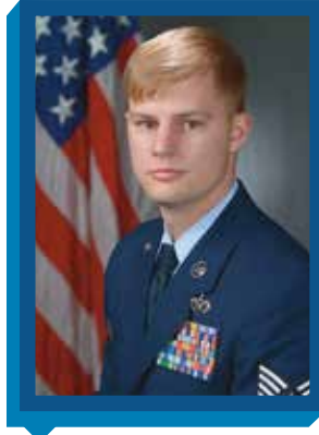
Division 4 Staff Sgt. Jesse A. Cornell Chapter 1076 Lackland AFB, Texas