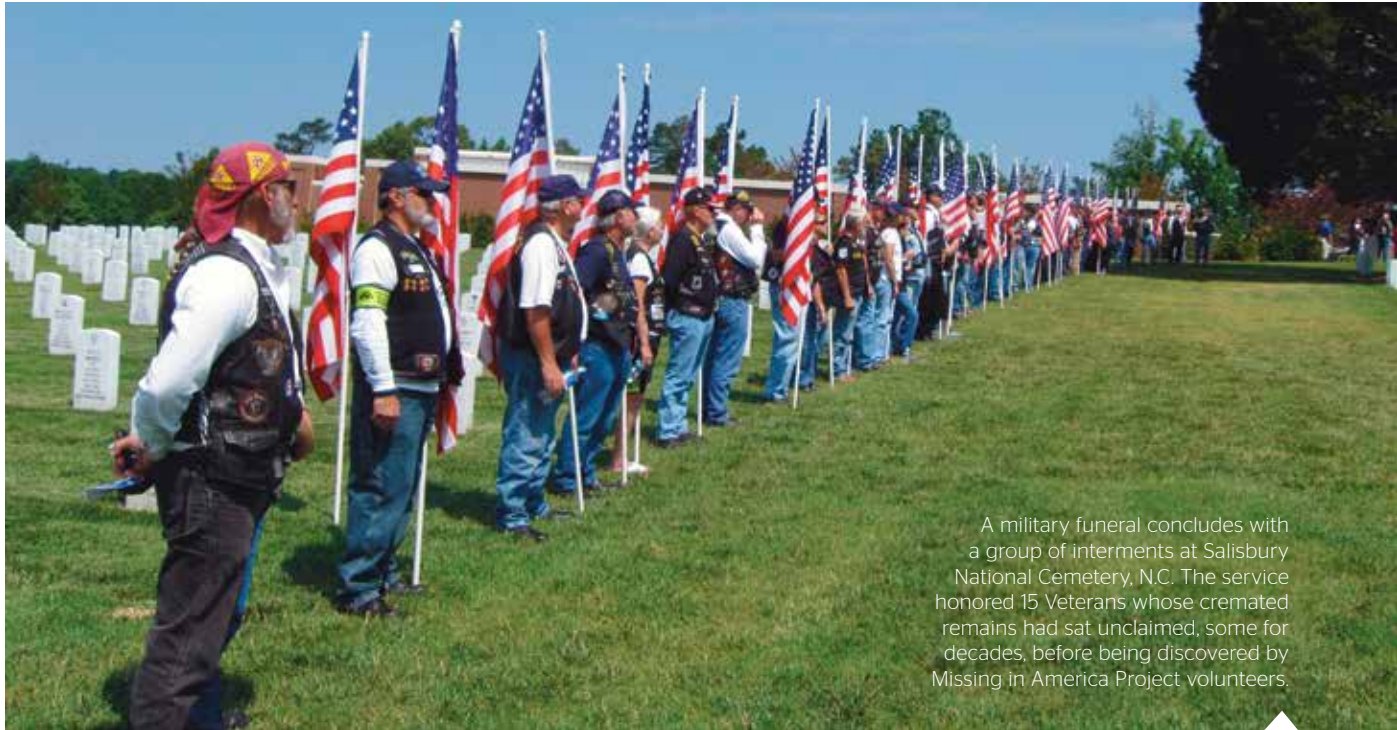
A military funeral concludes with a group of interments at Salisbury National Cemetery, N.C. The service honored 15 Veterans whose cremated remains had sat unclaimed, some for decades, before being discovered by Missing in America Project volunteers.

inter unclaimed cremated remains of American Veterans,” and to “provide honor and respect to those who have served this country by securing a final resting place for these forgotten heroes.”