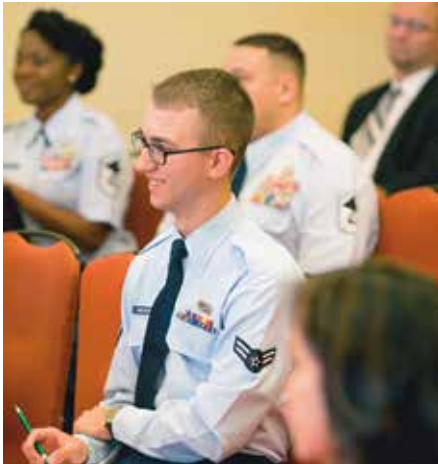
First-time AFSA Conference attendees are warmly welcomed during special first-timers' training and events.