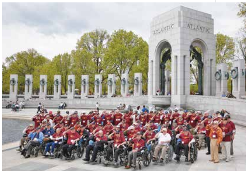
A group of WWII Veterans salutes in honor of fallen servicemen during an Honor Flight trip to the World War II Memorial in Washington, D.C.