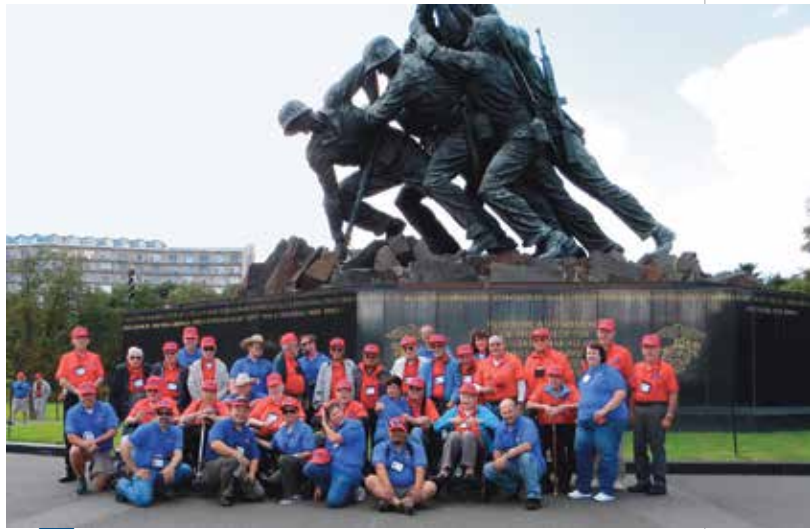
A group of Honor Flight participants and supporters pose in front of the Marine Corps War Memorial in Arlington, Va. The memorial depicts the flag-raising scene from Iwo Jima in WWII, but it honors all U.S. Marines who have given their lives.

Visit www.honorflight.org for more information and to locate a hub in your area.