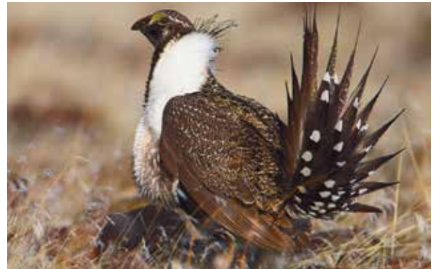
The bird in question: Centrocercus urophasianus , or the greater sage grouse.

While the greater sage grouse issue will have its turn, the major conference issues of concern appear to stem from changes to the personnel retirement system. While both Chambers agreed to many of the suggestions offered by the Military Compensation and Retirement Modernization