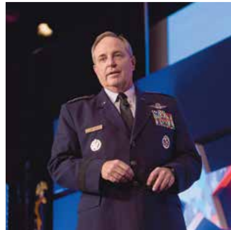
Air Force Chief of Staff General Mark Welsh III addresses Airmen and discusses the importance of leadership during AFSA PAC 2015.