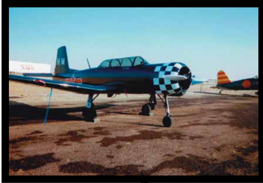
Thanks to the Lend-Lease program, which brought AAF aircraft, like this Soviet Yak-18 (left), to the Soviets, the Red Air Force began to thrive late in the war.

Soviets had seen in the skies around Stalingrad had already tapered off significantly by the end of 1941. For most of 1942, Stalingrad—from the air, at least—was all but abandoned.