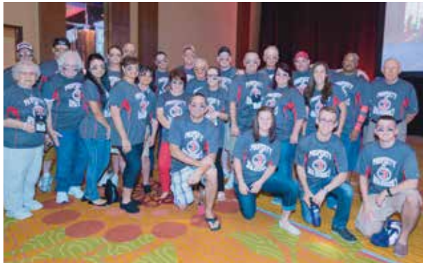
This year's theme, Uniting Airmen, inspired sports fans to don apparel in celebration of their hometown teams. Division 3 hit a home run with their custom shirts.