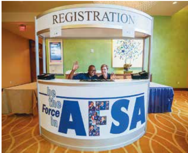
Excited to open for PAC registrations, your HQ Team was ready, willing and able to help direct attendees.