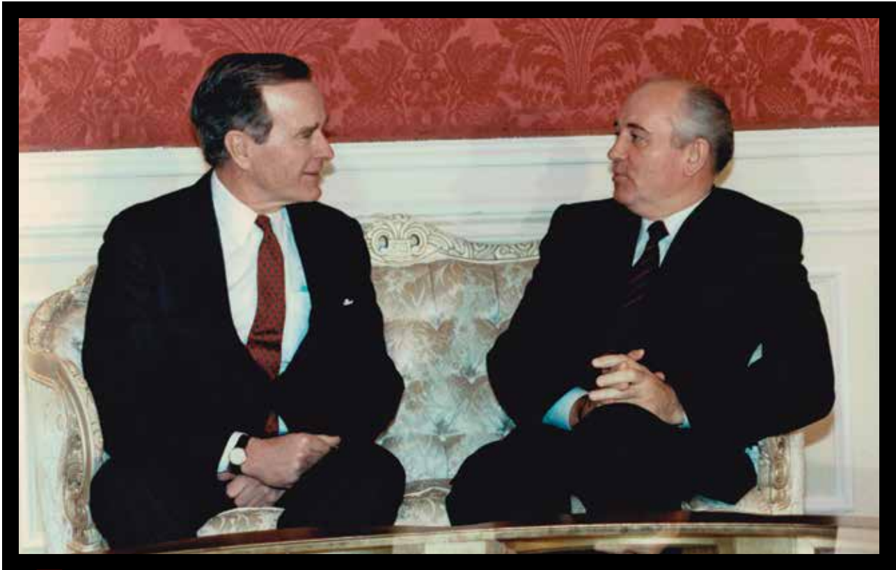
Despite the successes of the U.S.-to-Soviet Union Lend-Lease program during WWII, photos like this one, showing Vice President G.H.W. Bush, left, and Soviet Premier Mikhail Gorbachev, were rare in the first four decades following the war.