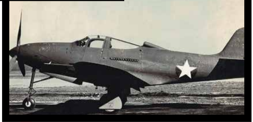
The U.S. sent 4,700 P-39 Cobras, more than any other type of aircraft, to the Soviets during WWII's Lend-Lease program. The shipping route was often complex—across the Atlantic, into North Africa, then shuttled through Iran and finally up over the Caucasus Mountains and into the hands of Soviet enlisted mechanics for reassembly.