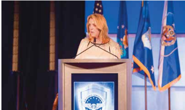
Secretary of the Air Force, The Honorable Deborah Lee James speaks about the success of today's Air Force and the challenges of its future. Secretary James also presented awards at PAC's Honors Banquet.