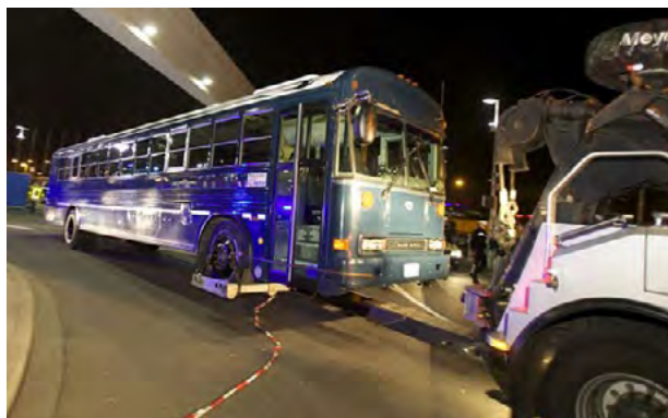
The bus that transported Tech. Sgt. Trevor Brewer and his fellow Airmen from the 48 th Security Forces Squadron being towed from Frankfurt Airport, Germany following the attack in March 2011.

To learn more about the IWI, visit the Invisible Wounds website.