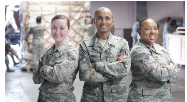
Photos for illustrative purposes – may not denote an official endorsement.

We thank you in advance for your AFSA membership and support.