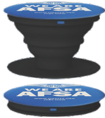
Popsockets © Phone Grip... $15