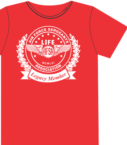
Red LEGACY MEMBER T-Shirt Adult Small, Medium, Large $15.00 XLarge $16 3XLarge $18 2XLarge $17 4XLarge $19