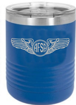
Double Insulated Stainless Steel Tumbler Hot & Cold w/Lid ... $20