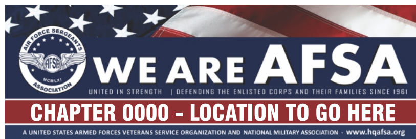
Personalized Large Outdoor/Indoor Banner 6' x 2 feet tall - rolled and hemmed edges w/grommets $75 plus shipping