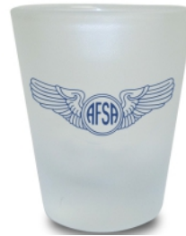
Frosted Shot Glass... $10