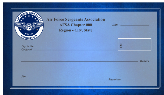
Personalized Large Reusable Presentation Check 36" x 20" (works with dry erase marker)... $95 plus shipping