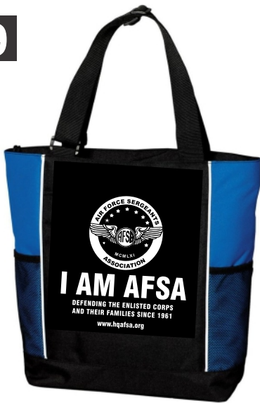
I AM AFSA Tote Bag w/ Mesh Pockets... $20