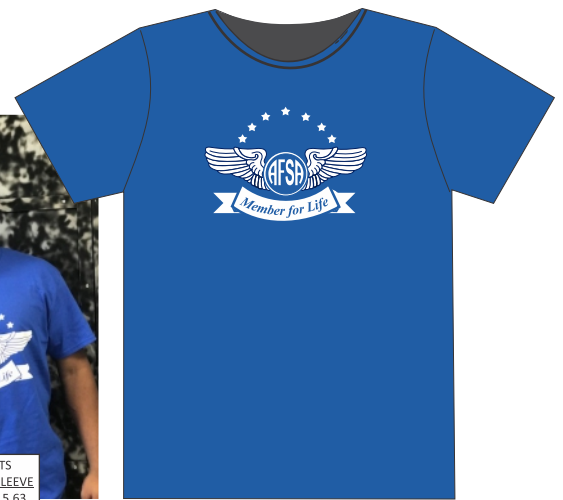
Royal Blue MEMBER FOR LIFE T-Shirt Adult Small, Medium, Large $15.00 XLarge $16 3XLarge $18 2XLarge $17 4XLarge $19