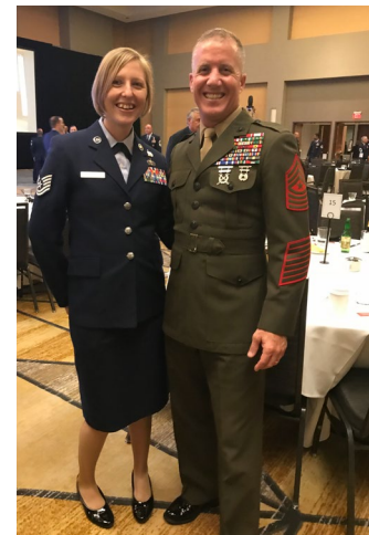
"Sergeant Major, just how excited are you that Marines can now be AFSA members, too?" Semper Paratus