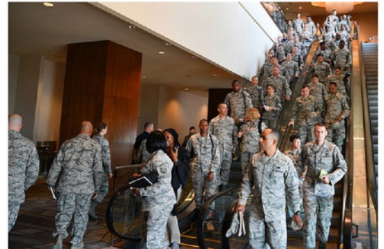
Over 1,500 Airmen attended the PAC18 for a wide range of professional development opportunities.