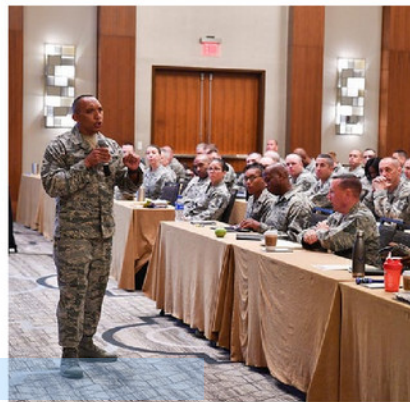
The MAJCOM Training at PAC18.