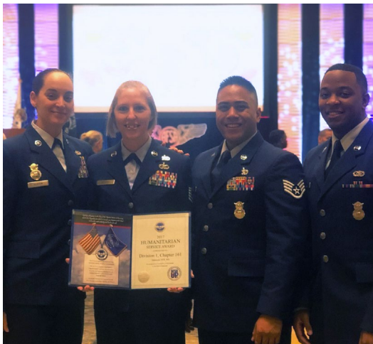
AFSA Chapter 161 was on the verge of being disbanded less than two years ago, now they are stronger than ever and were selected to receive the Humanitarian Service Award for 2017.