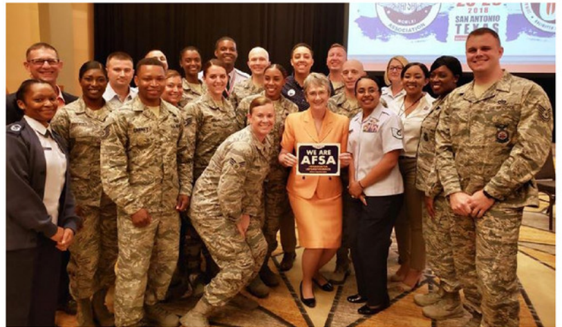
The Secretary of the Air Force Heather Wilson was an amazing and inspirational speaker. She even took the time to meet and greet us and pose for photos.

Had a great time at my first PAC. Looking forward to it again next year! My favorite experiences were the former CMSAF panel and the opportunity to network with so many great people. It was great to receive informal mentorship from the Air Force top leaders. Not only were they fantastic speakers, but they took the time to answer questions, meet and greet and take a few selfies. I also enjoyed the experience of the AFSA elections and the voting process. It was a great learning experience and really showed that our voices do matter.