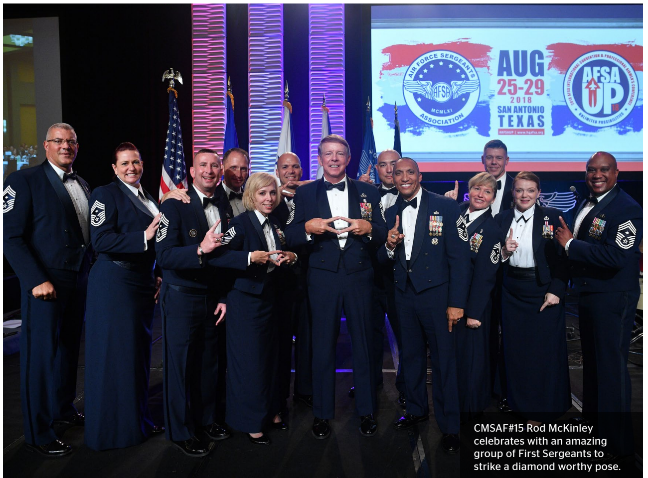
CMSAF#15 Rod McKinley celebrates with an amazing group of First Sergeants to strike a diamond worthy pose.