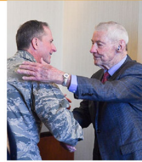
General Goldfein and CMSAF#5 Gaylor shake hands.