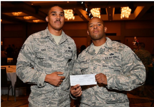
Everyone comes together to raise funds during the Parade of Checks.