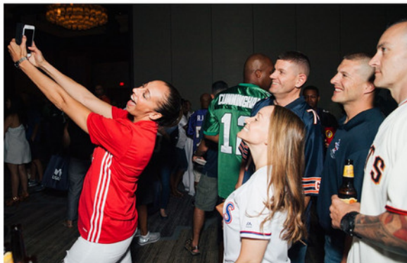
There's always time for a selfie at the Opening Night fun.