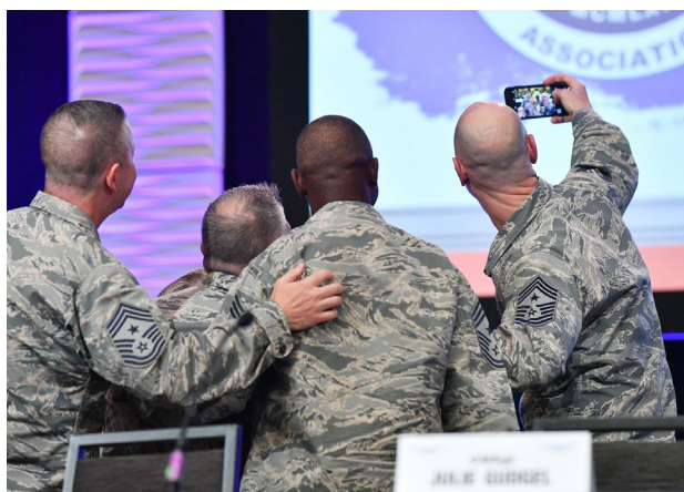
The Command Chiefs join in the selfie fun before the panel discussion and Q & A.

REPORTS – Report time is fast approaching so please be diligent and complete and forward your reports as soon as possible. Also, we are approaching the annual election and end of year. Please be sure to complete your Directory of Officers, budget, and other reports by the established deadline.