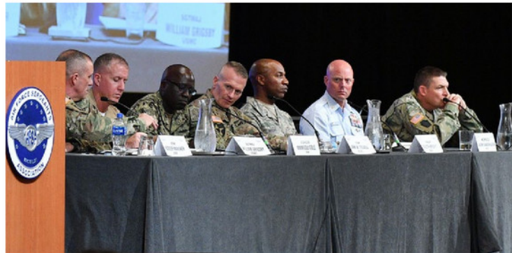
The Armed Services Senior Enlisted Leadership Panel provide a great joint services perspective.