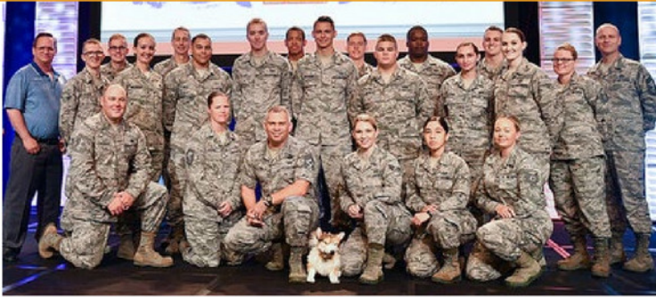
Division 3 poses with the AFSA Alpha Dog Mascot.