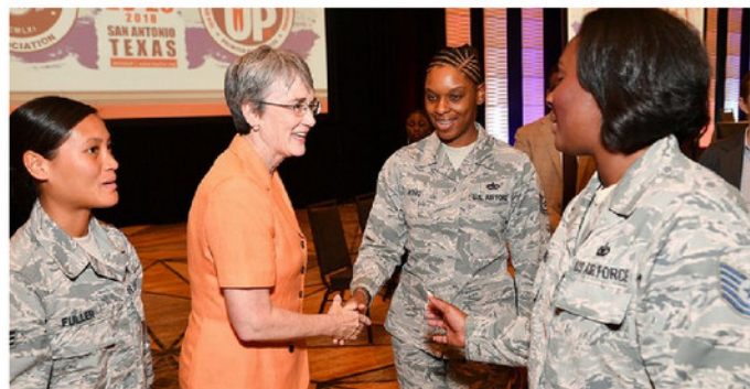
Secretary Heather Wilson meets and greets conference participants.