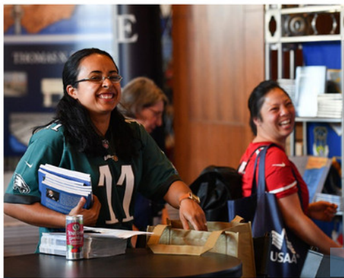
The InfoExpo was filled with great mission partners.