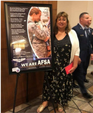
Scavenger Hunt items were hidden throughout the Grand Hyatt San Antonio with Prizes provided by the InfoExpo Partners.