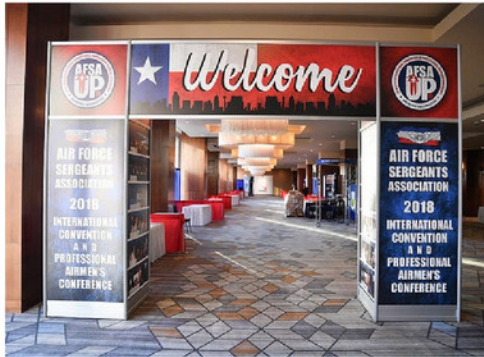
Welcome to San Antonio and the 2018 AFSA PAC.