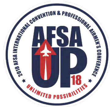
Exhibit Booth Schedule

CONTACT: Email: AFSAComm@hqafsa.org , website: www.hqafsa.org