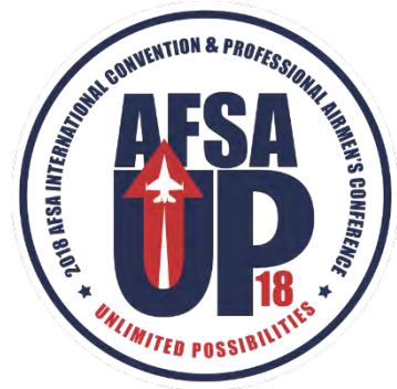
Exhibit Booth Schedule

CONTACT: Email: AFSAComm@hqafsa.org , website: www.hqafsa.org